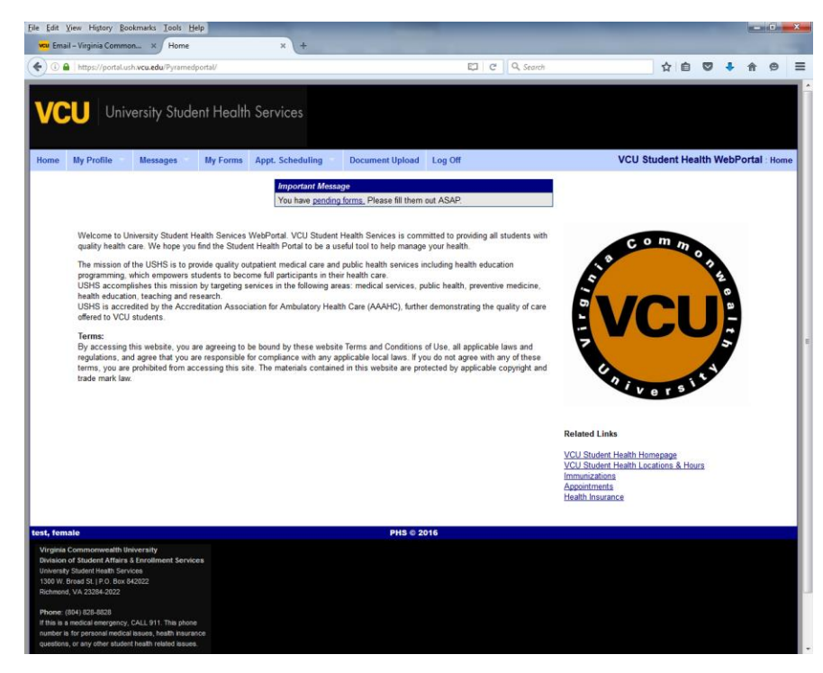
Step 1: Select the Influenza form and open it.

Go to the Student Health WebPortal login page at <u>https://students.vcu.edu/health/web-portal/</u> You will need your VCU eID and password. Once you have accessed your WebPortal, click on "Pending Forms" under the important messages section.